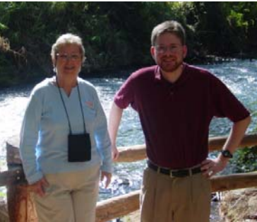
Tel Dan Nature Reserve, Israel November, 2004